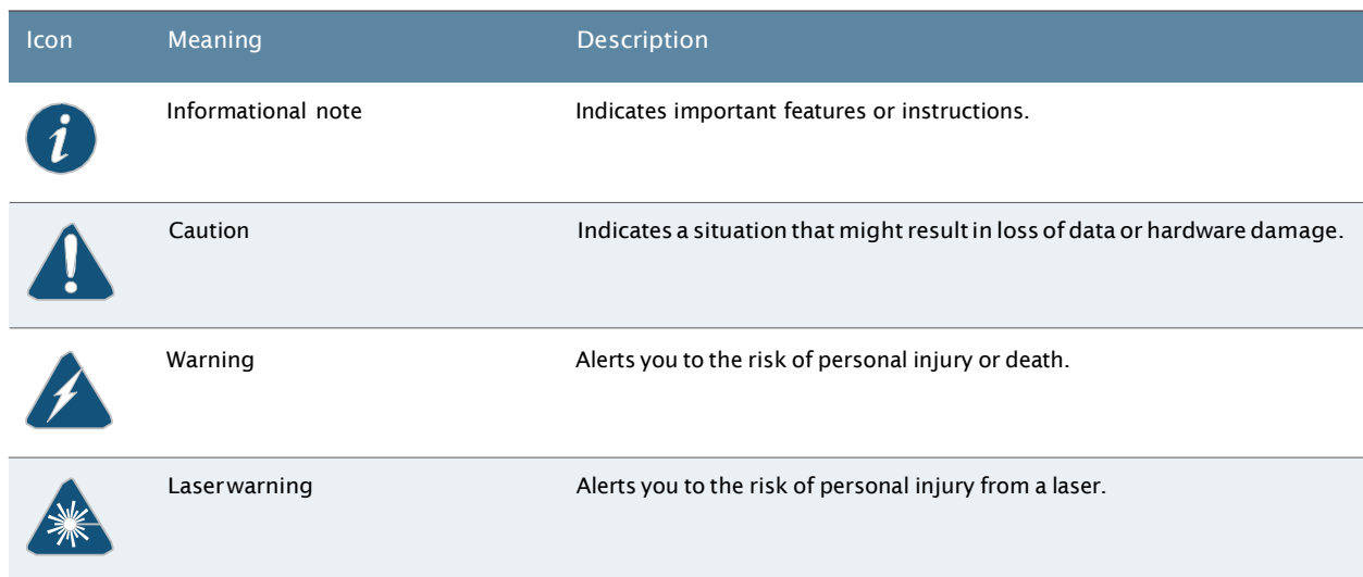
Table 1: Notice Icons

Table 1 on page vii defines notice icons used in this guide.