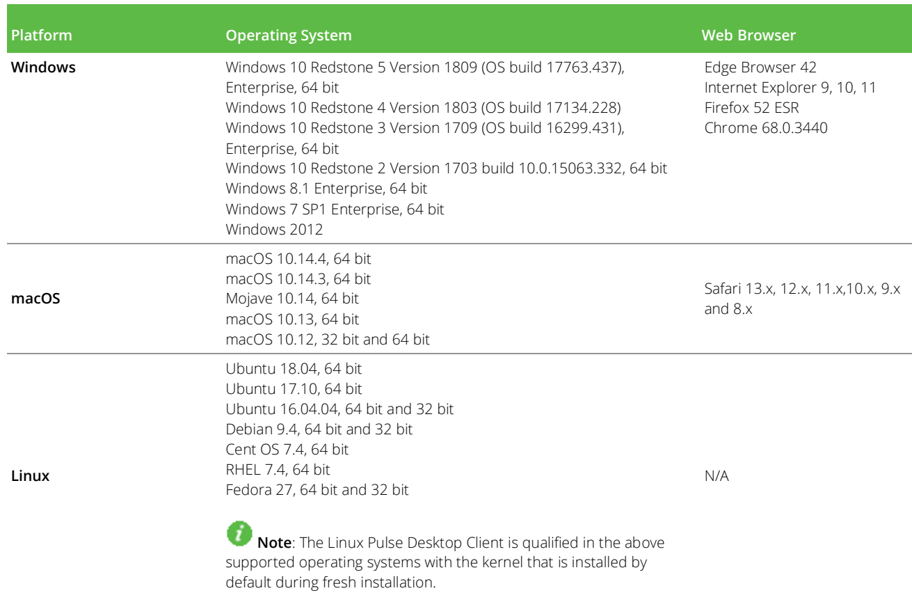
Table 4: Pulse Secure Desktop Client Compatible Platforms