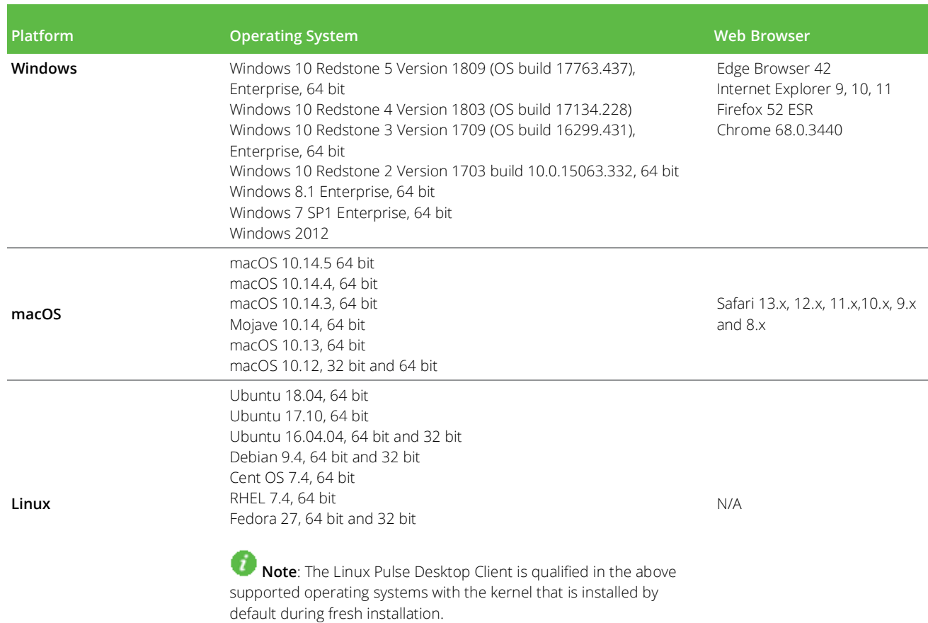
Table 4: Pulse Secure Desktop Client Compatible Platforms