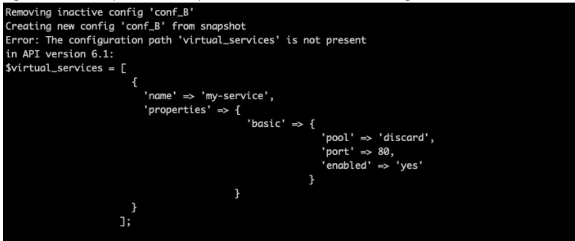
Figure 3 Example error output from a Docker container log

In this example, the configuration document incorrectly refers to "virtual_services" instead of "virtual_servers".