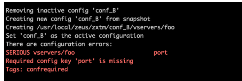
Figure 4 Semantic errors reported in the Configuration Importer log (or container error log for Docker deployments)

To check if the configuration was applied as you expected, see the Configuration Importer log after you trigger an import: