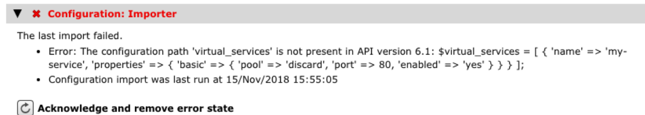
Figure 2 Configuration Importer error output on the Diagnose page.

To view import error details when applying configuration to a Docker container, view the container logs.